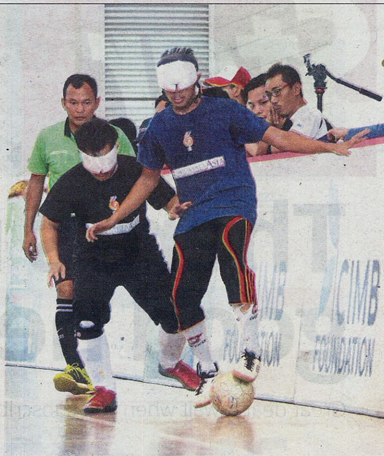
A Team Johor player (left) trying to tackle his opponent from Team GTC while the fans cheer them on.