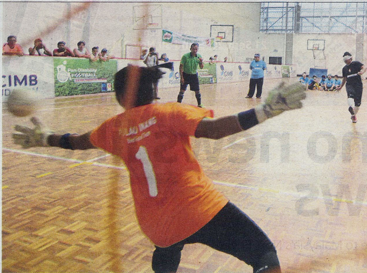
The Penang goalkeeper saving a kick during the penalty shoot out.